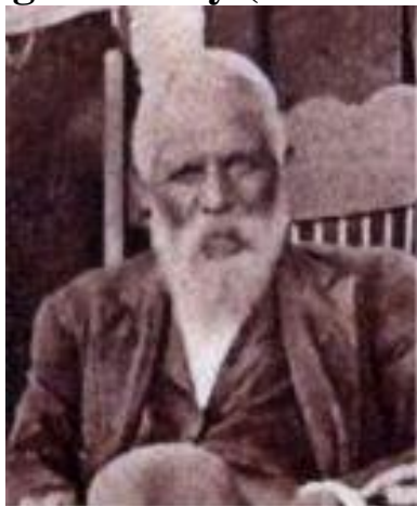
Benjamin Gray (Confederate Navy)